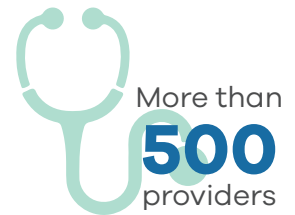
Over 85% are Board Certified in their field